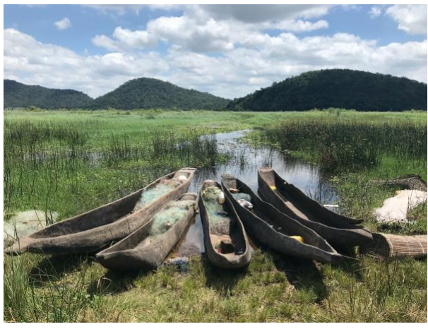
Images top to bottom: the majestic Victoria Falls, visited by approx. 1 million people annually; an aerial view of Mazabuka sugar plantation; fishing boats on the Kafue River.