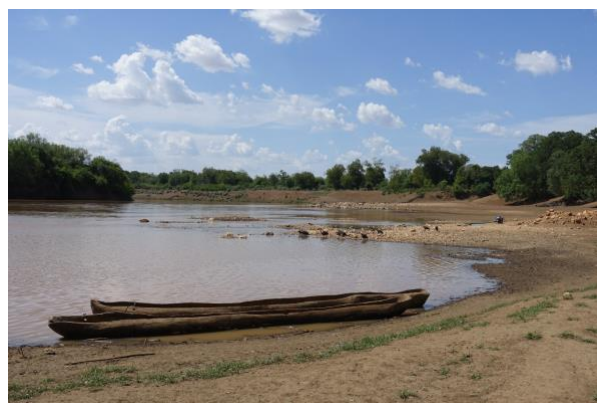
Image: fishing boats on the Omo River.

Overall, our analysis demonstrated that an integrated method of governance utilising each of these three frameworks, termed the Law, Nexus, Goals (LNG) approach could act as a solid base in the formation of a comprehensive governance strategy in the OTB.